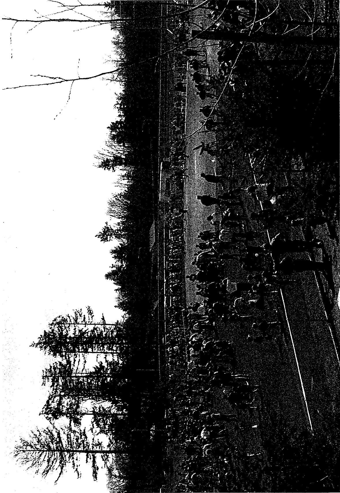
South King County Ballfield Park, April 1, 2000